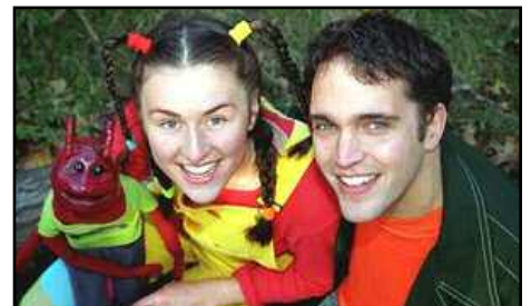
"Toronto's #1 Children's Entertainers" City Parent Magazine