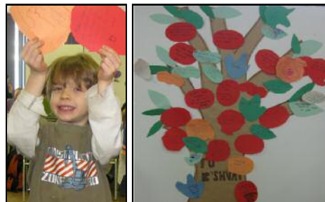
TSJCS student holds up his action leaf and fruit for the Community Environmental Action Tree.