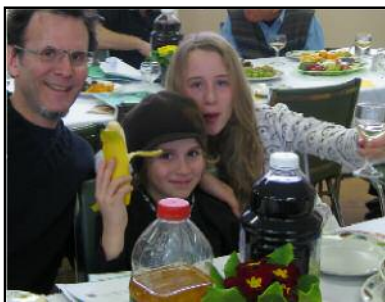
TSJCS family toasts L'Kham!