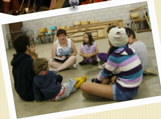
Now Theatre Camp...