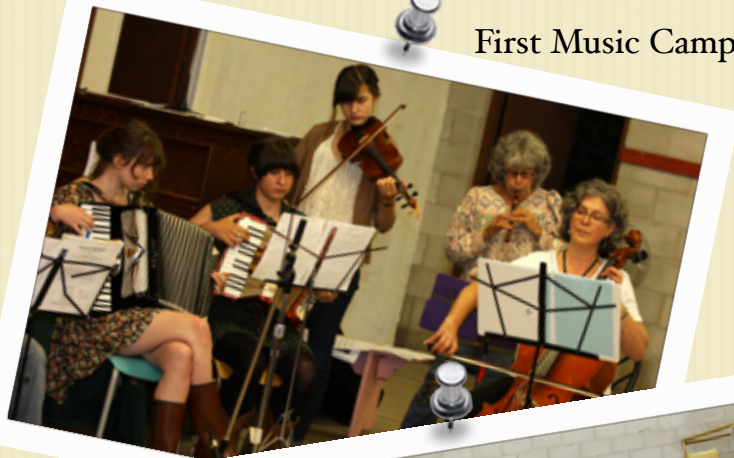
First Music Camp...