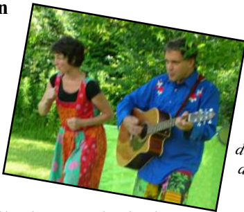
Alistair Ant delighted families at Naivelt's 2009 Kinder Kapers Weekend